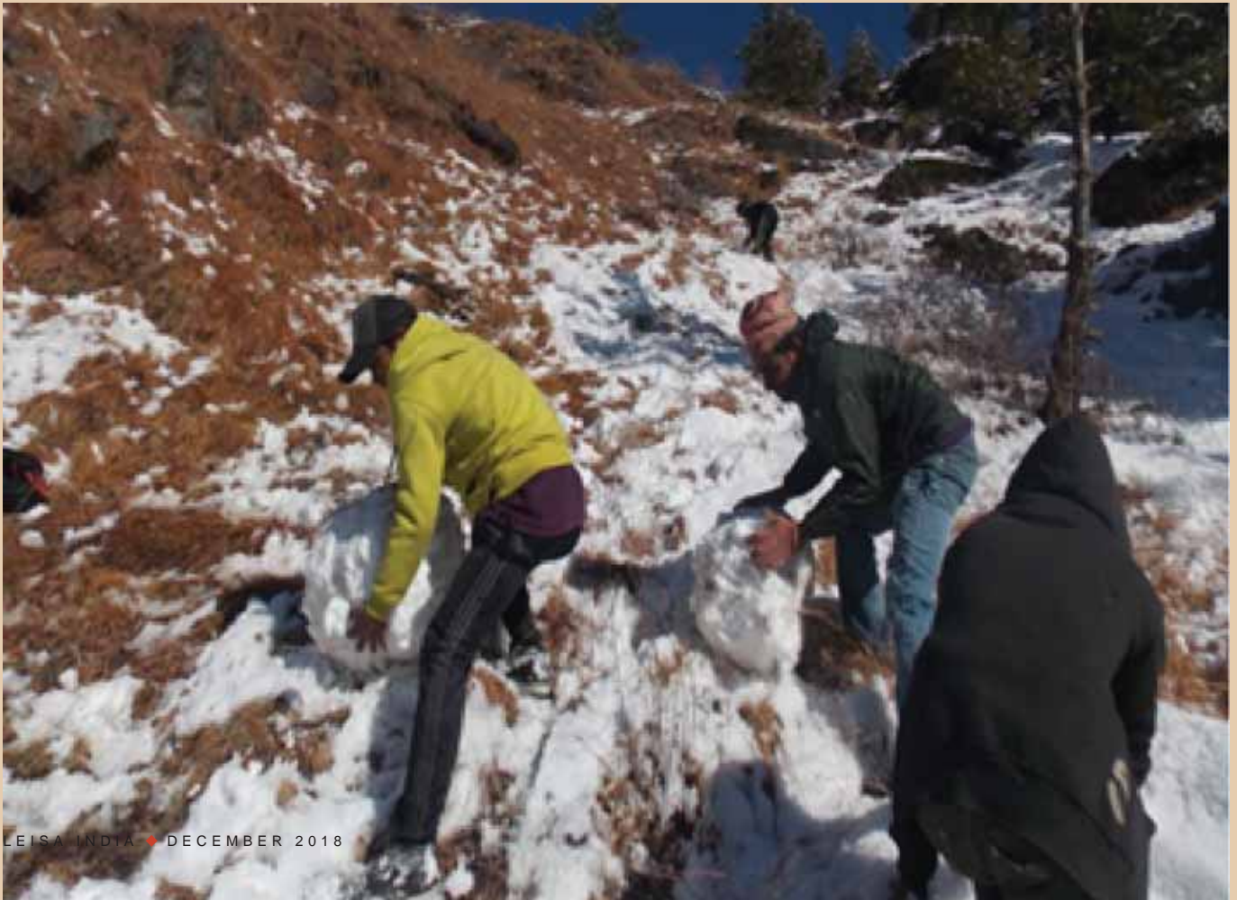
Rolling of snow ball

Farmers traditional practice with a little adaptation has resulted in enhancing the quality and quantity of apple production in Jumla district in Nepal. This low-cost technology has been most helpful for those farming communities with lesser water resources. Valuing the significance, this innovation has been institutionalized by the Government of Nepal to support apple farmers.