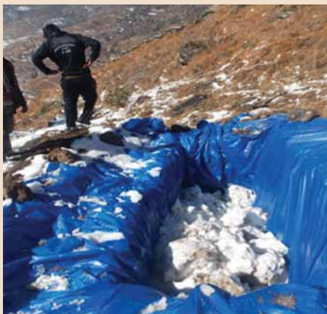
Snow balls rolled over and harvested in the pits

The final measurement of the three ponds was done after the snowballs had completely melt, during the end of April. The melted water was measured. To reduce the evaporation losses, the pond was covered with mulch material from tree trunks and pine leaves.