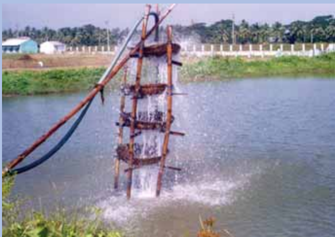
Indigenous way of tackling deficiency of deprived oxygen in the pond