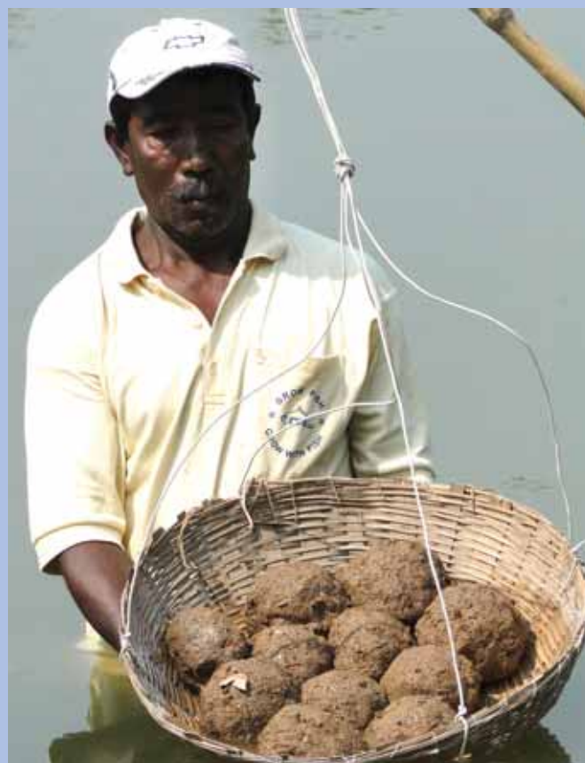
Simple methods are used for feeding fish

Ingenuity of farmers' innovations and improvements successfully tested over time should be given due recognition, lest such innovative ideas and spirit get lost for ever.