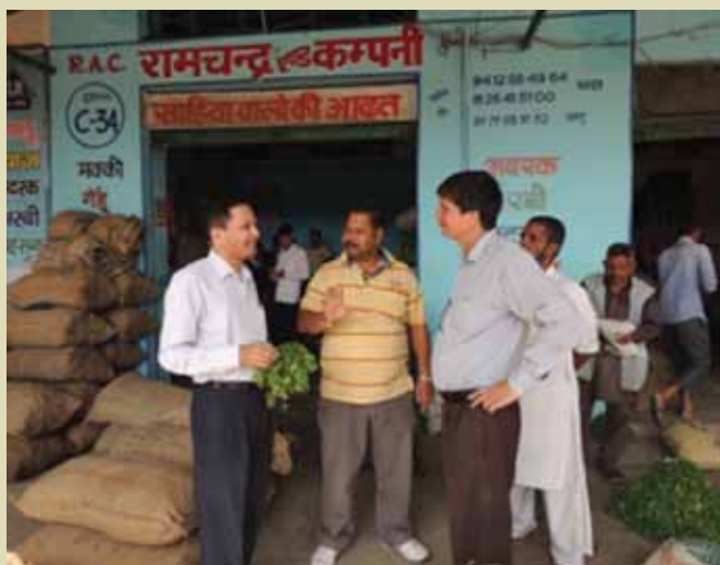
Wholesale agents in the market weigh the produce and provide receipts

know the prevailing price of different vegetables in the mandi, by calling the wholesale agents over phone. Based on the market price, they decide which vegetables to sell and harvest accordingly. After harvesting they pack vegetables into different sized bags, not exceeding one quintal. Each bag is labelled with name of the farmer and also name of whole sale agent to whom it is to be given. Farmers who have more number of bags, travel to the mandi with their produce in the utility vehicle. Those who have less, handover the bags to the utility vehicle driver.