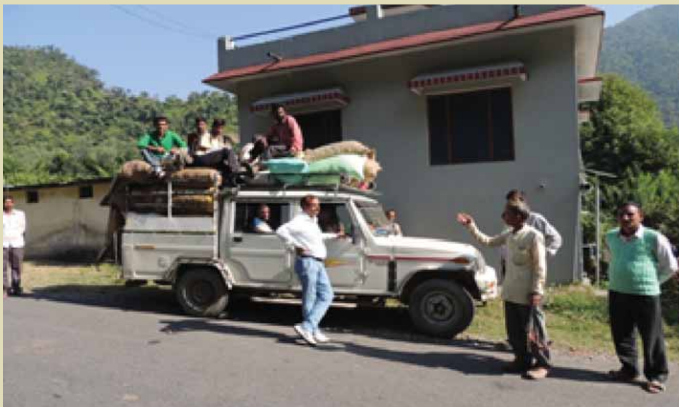
Utility vehicles improved the mobility of farmers and enhanced their exposure to markets

If required, utility divers also purchase and bring other household items from market for the farmers. For small things, farmers need not pay anything but for big/heavy items, they have to pay the carrying charges. Really, this innovation is a boon to the farmers in the remote hilly areas. They get the things done without travelling to the mandi/market so frequently, saving their time and expenses.