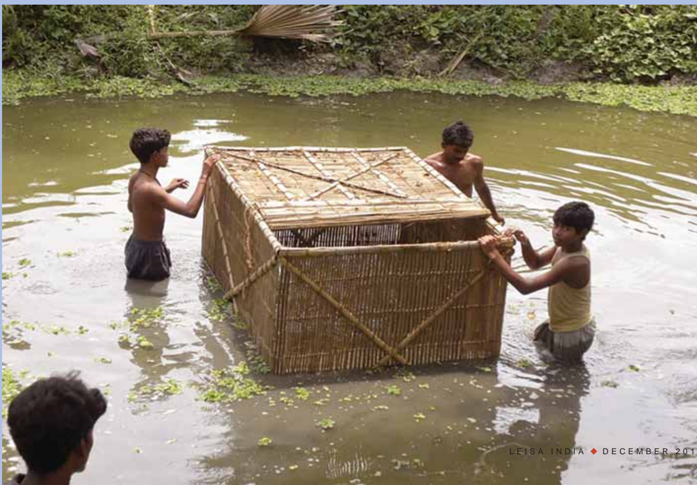
Bamboo baskets are installed to rear multiple species