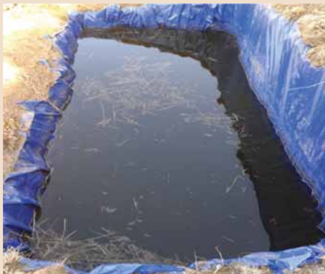
Water harvested in each pond was sufficient to irrigate around 125 trees in the orchard

broadcasted from the local and national FM radio station and television. A Joint Secretary led team from Ministry of Agriculture Development visited the farmer's orchard. Since the Directorate of Extension under Department of Agriculture has been supporting small irrigation schemes like rainwater harvest, plastic pond irrigation, small and medium canal irrigation (construction and maintenance) in Nepal, the Ministry later re-amended the Plastic Pond Irrigation Directive 2065 (2008) and added provision to support snow-harvest pond irrigation in the directive. The innovation has now been institutionalized in the