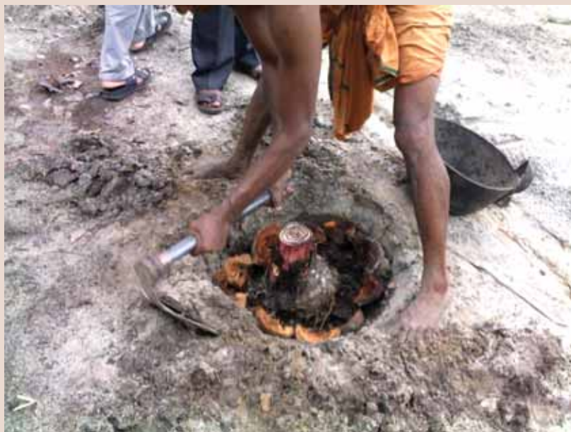
Burying husk in banana pits helped the plants from lodging

Tuber crops except Taro planted during normal planting time resulted in severe crop loss due to water logging. Farmers tried several adaptations. They planted short duration varieties of tapioca like Vellayani Hraswa , Sree Jaya , and Sree Vijaya . Planting time of Tapioca was advanced from February to October-November. By adopting short duration varieties and advancing planting time of Tapioca, the farmers could get a reasonable yield (average 3.2 kg/plant). In case of elephant foot yam and dioscorea, the farmers retained the previous year's crop in the field and obtained average yields of 6.3 kg/