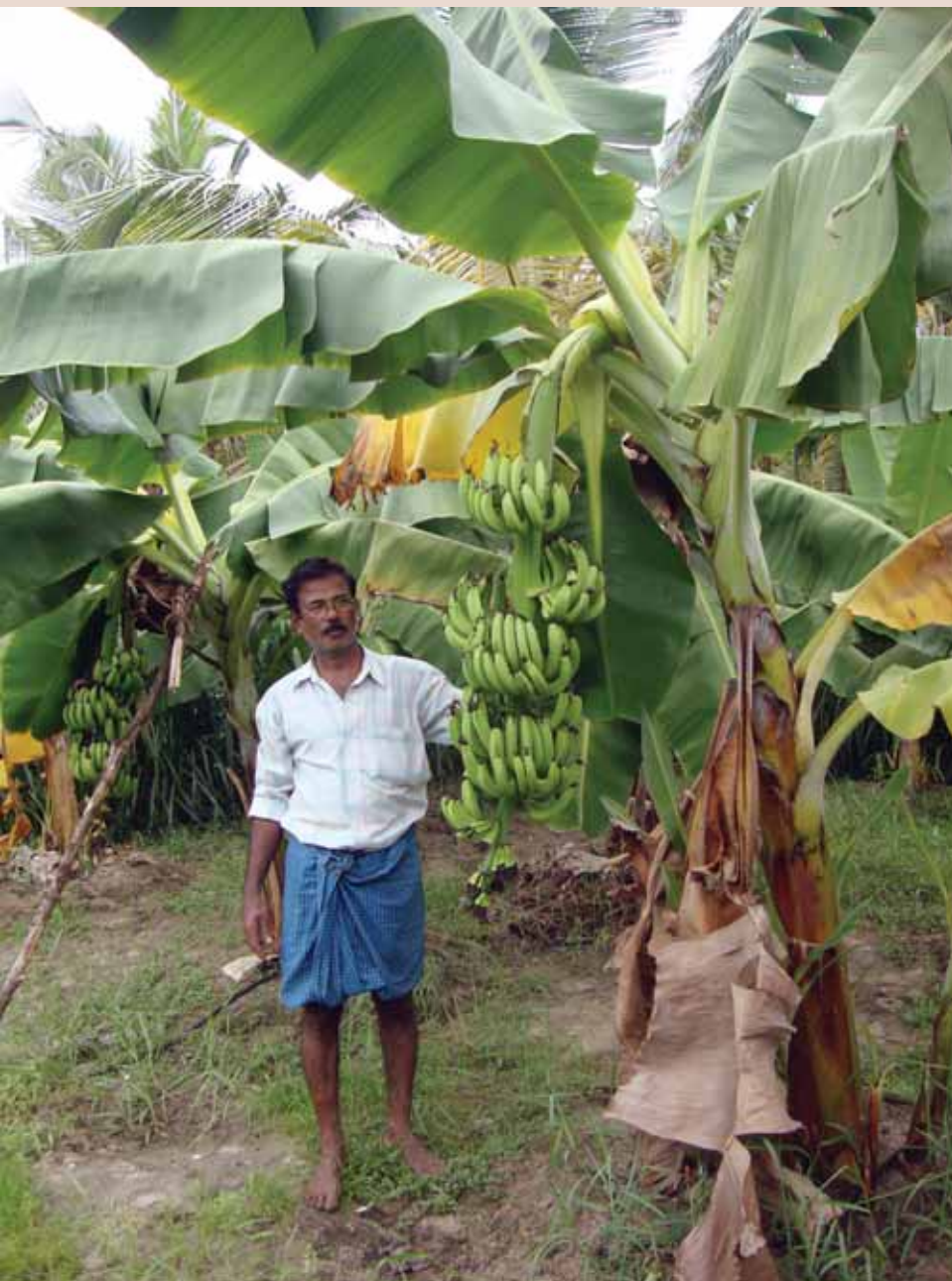
Healthy plants with healthy fruits in Robusta banana

pineapple and banana and partial crop loss due to water logging, the net profit from coconut based farming system (CBFS) during 2012-13 was only moderate. However, Benefit-Cost Ratios of 1.95 and 1.59 revealed feasibility of the CBFS under coastal conditions, which prompted the farmers to undertake and validate adaptation measures against climatic vagaries. Through intensive crop diversification and cost effective adaptation measures, profitability of the system could be considerably enhanced. The net income from the coconut based cropping system varied from Rs.1.35 – 1.89 lakh during