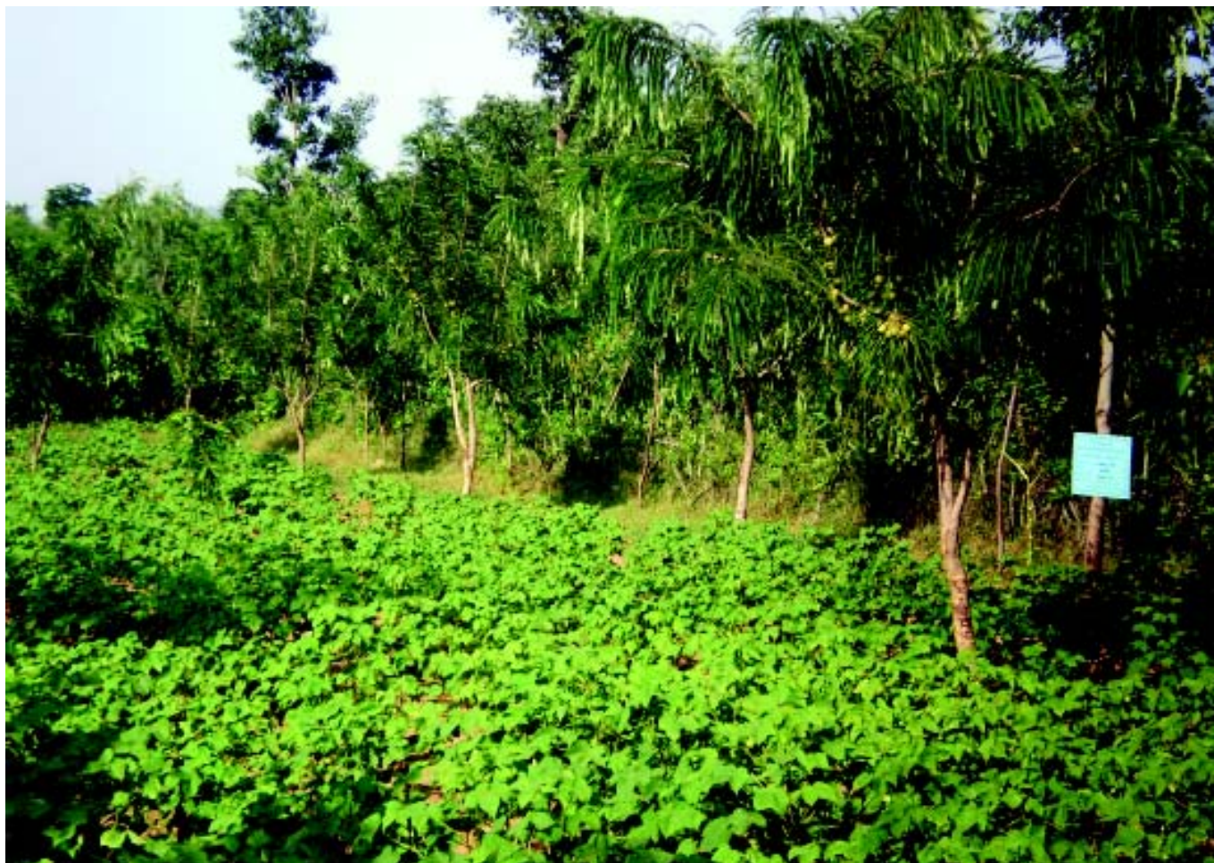
Indian gooseberry trees bordering cotton crop