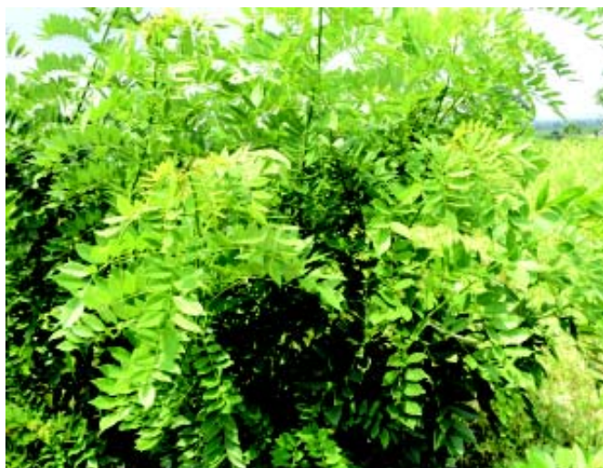
Trees on farms for yielding additional biomass