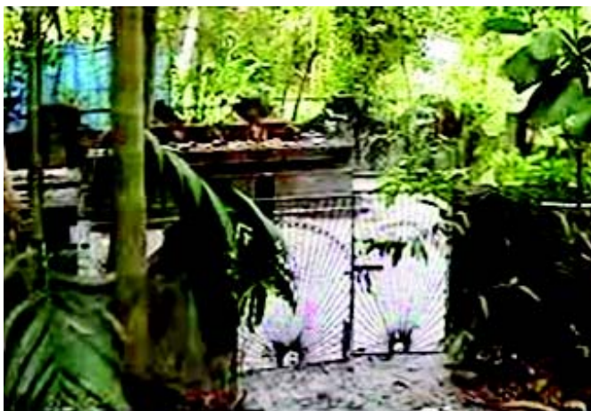
Sacred groves are a repository of tree biodiversity.

sericulture, apiculture, aquaculture, floriculture, nursery units etc making way for the home gardens to be categorized as subsistence with subsidiary commercial interest. Such type of specialization aided the home garden with continuous production throughout the year helping in better income generation and also family labour involvement.