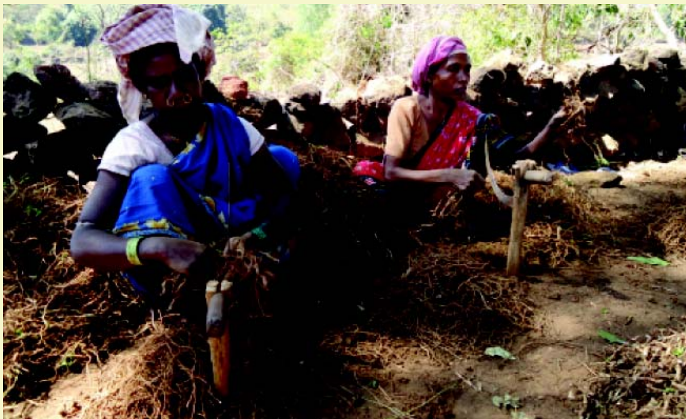
Women harvesting Pipla roots