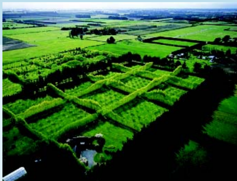
Trees on field bunds in New Zealand