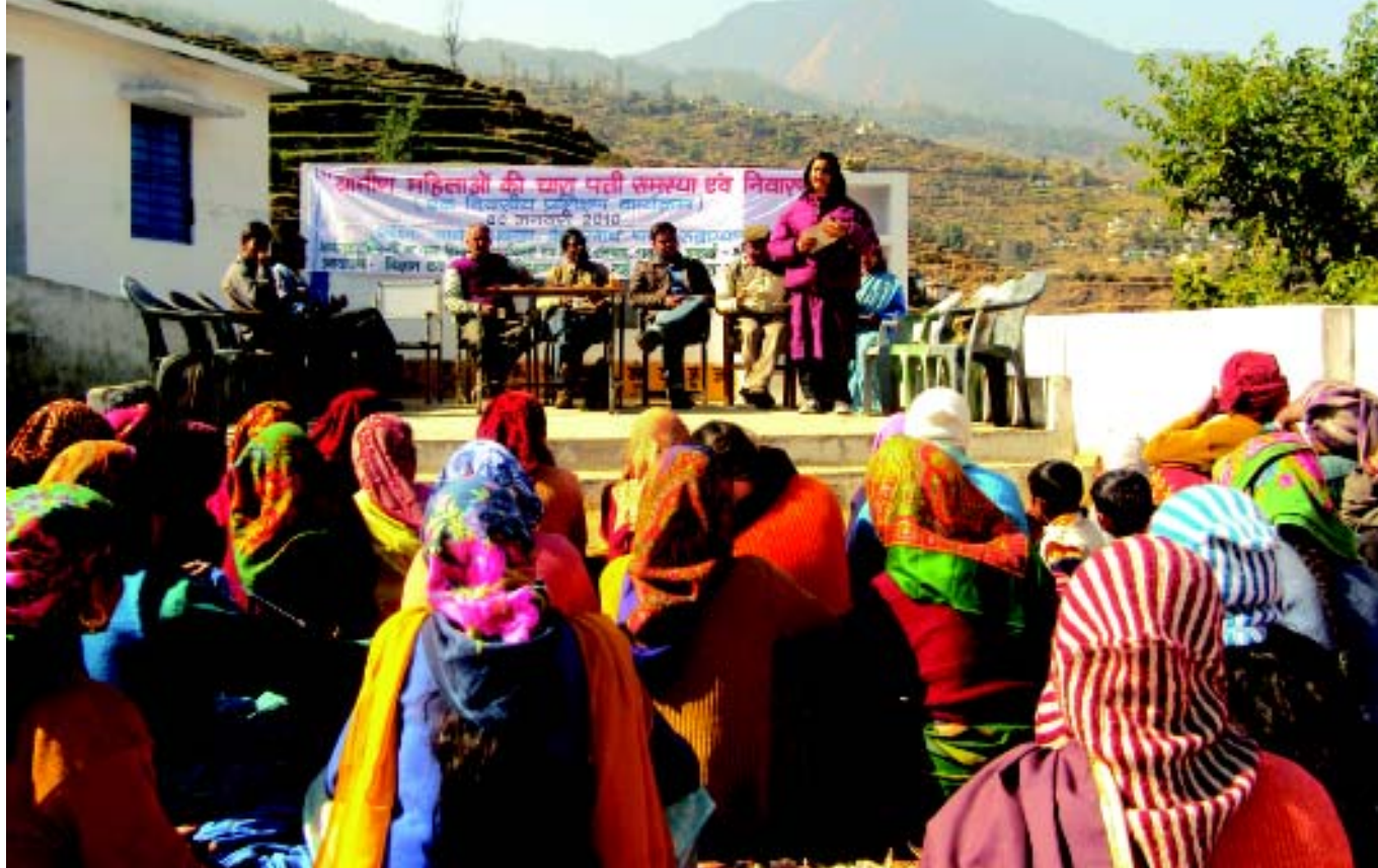
Women come together to discuss fodder problem and explore solutions