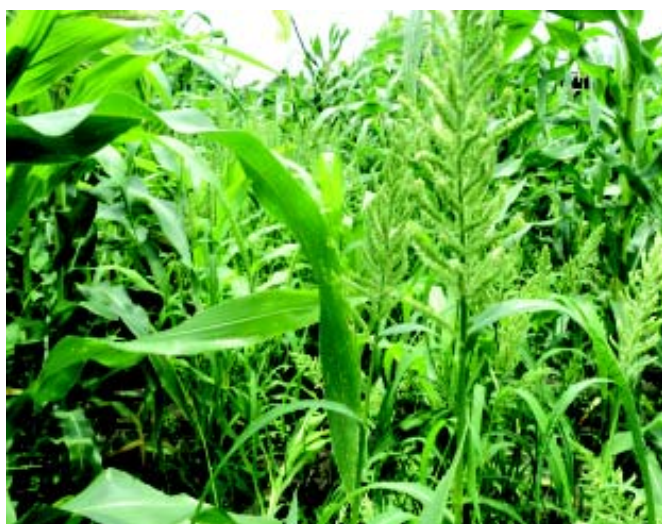
Farm in the flowering stage

Soil fertility improvement with available resources, productivity enhancement in rain-fed areas and promoting food security with low external inputs for sustainable rain-fed agriculture were the major objectives of the programme which has been achieved to a large extent. There have been pitfalls and challenges which were addressed and improvements were made to make the program a success. Presently, 96% of tribal farmers are directly involved in the programme. Local farmers are identified and trained for monitoring and providing further guidance. The programme is integrated and coordinated with all departments and agencies like Integrated Tribal Development Authority (ITDA) for convergence. Social structures and institutional building is inbuilt into programme for sustainability.