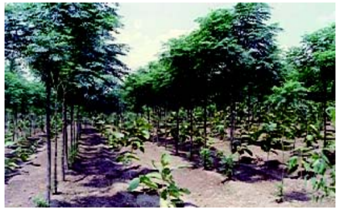
Farm forestry - teak with melia

Even for expansion of various fruit crops, there are limitations of labour, resources and market beyond certain scales of operation. Unless efforts are made to process the fruits for value addition and preservation, farmers are not likely to cultivate most of the species on a large scale. For crops like mango, in the absence of cold storage and processing, glut during a particular period in the year may affect the price realisation. In such a situation, farmers are likely to select the next best crops for cultivation. Looking to the present trend of tree planting on private lands, it can be