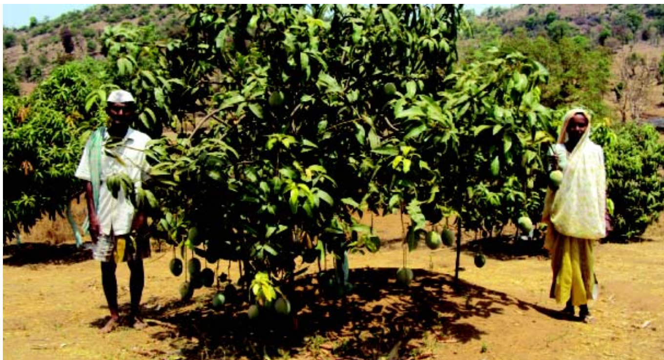
Mango trees on marginal lands - Farmers enjoying the benefits under Wadi Programme

from such wadi tukadi and SHGs have formed a 'Vibhag' for future planning of marketing and processing of produce like cashew, mango and vegetable. The processing of cashew is now being taken care of by the participants only. Vibhags are linked further with Vasundhara Agri-horti Producers' Company (VAPCOL) a producer organization that brings together farmers to help them market their produce.